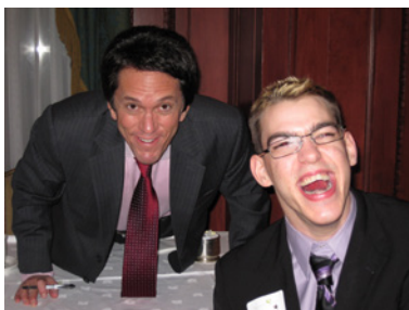
MARCH 2011 Mitch Albom Best-selling author of Tuesdays with Morrie and The Five People You Meet in Heaven .

Since its 2011 debut, Stories of Courage & Grace has raised $3.5 million, helping to sustain many of the great programs and services that make The Virginia Home so unique.