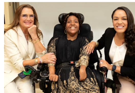
APRIL 2024 Brooke Shields Actor, stage and screen, best-selling author and advocate for women in the arts.