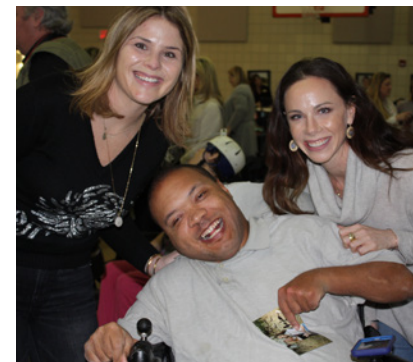
MARCH 2018 Jenna Bush Hager and Barbara Pierce Bush Daughters of former president George W. Bush.