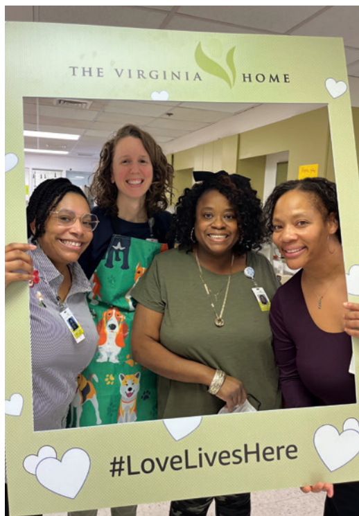
Our unstoppable Occupational Therapy Team!

THE VIRGINIA HOME STAFF is a qualified, knowledgeable and caring group of men and women who seek to improve the physical, social and emotional